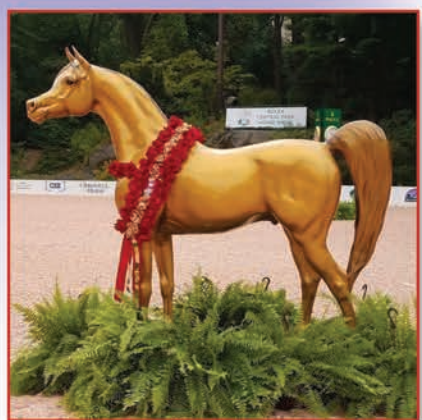
Below: Goldie standing Center Ring at the Arabian U.S. Open 2017