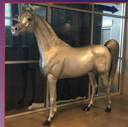
"Warrior for Humanity" (silver) was auctioned off in July 2017 with all proceeds going through the Warrior Horses for Warrior Kids program to the Leukemia and Lymphoma Society!