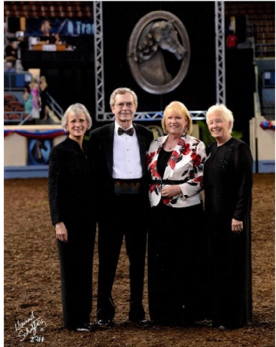
Morgan Grand Nationals